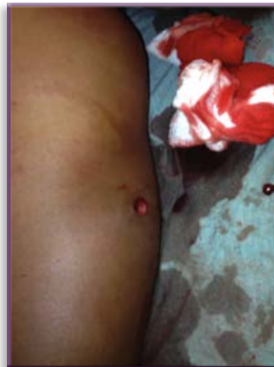
Figure 1 The entrance wound is in the upper left arm over the proximal portion of the triceps muscle belly and distal to the margin of the deltoid muscle.

The diaphoretic patient was completely unresponsive. The primary emergency physician focused on hemorrhage control, and a partner focused on securing the airway, which was initially done with bag-valve-mask ventilation. Monitoring at that time showed a heart